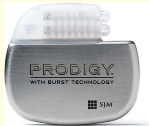
Figure 3. Prodigy with burst technology. From the Clinician's Manual, reproduced with permission from St. Jude Medical Neurodivision, Plano, TX, USA.

Burst stimulation has also been used for peripheral nerve stimulation for FBSS [9]. Following successful pain relief by transcutaneous electrical nerve stimulation of the occipital nerve, a subcutaneous electrode was implanted and three stimulation designs are tested: a classical tonic stimulation, consisting of 40 Hz stimulation, a placebo, and a burst stimulation, consisting of 40 Hz burst mode, with five spikes delivered at 500 Hz at 1000 \mu\text{sec} pulse width and 1000 \mu\text{sec} interspike interval. The patient's stimulation results demonstrated that burst mode was superior to placebo and tonic mode, and that the burst design was capable of suppressing both the least and worst pain effectively. She has remained almost pain free for over 3 years [9].